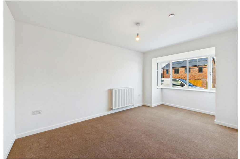
Plot 7 Somerford Reach, Cae Heulog, Arddleen, Llanymynech, SY22 6FJ £380,000

Somerford Reach Phase 2 presents an exceptional opportunity to acquire a new home in the desirable rural community of Arddleen. This extension of the highly successful Cae Haulog development comprises 14 thoughtfully designed residences, situated conveniently between Welshpool and Oswestry, with easy access to the A483. The development offers a diverse selection of properties, including three-bedroom houses and bungalows, four-bedroom houses, and two smaller homes specifically designated for local first-time buyers at an affordable price point. Anticipated for completion in May/June 2026.